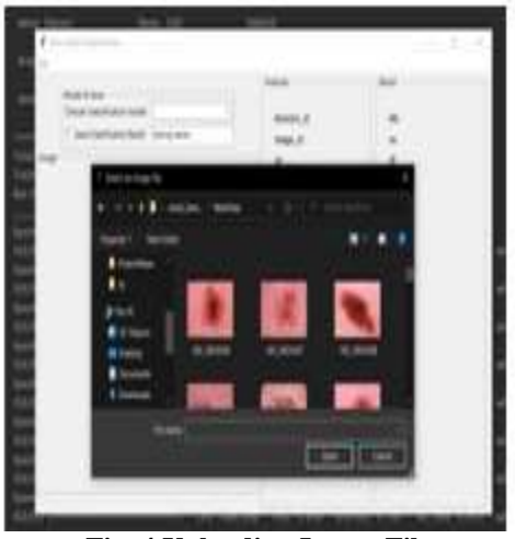
Fig. 4 Uploading Image File