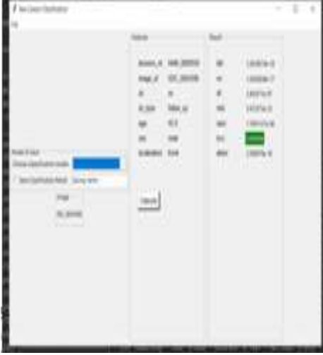
Fig. 5 Showing final result